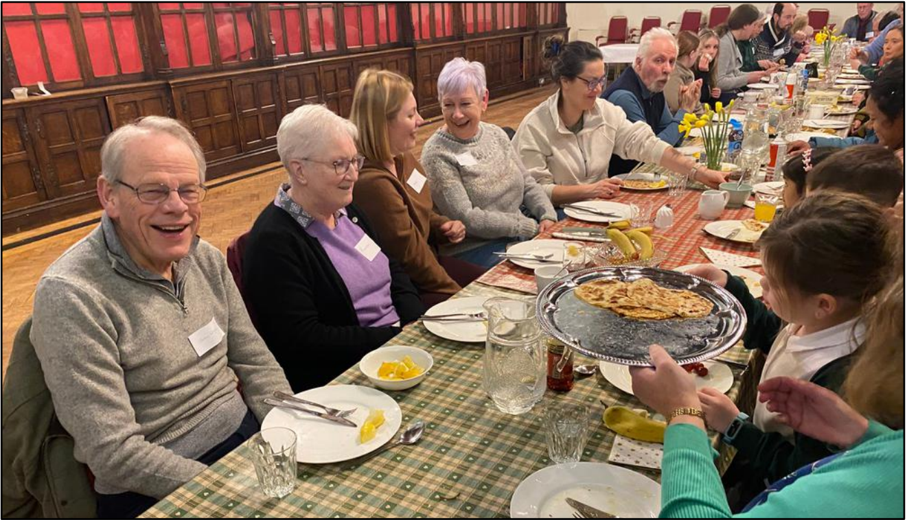
Shrove Tuesday 2024 pancake party in the Chapter House

members. Groups from the congregation enjoy social meetings, cultural evenings and trips to places such as Pitlochry Theatre.