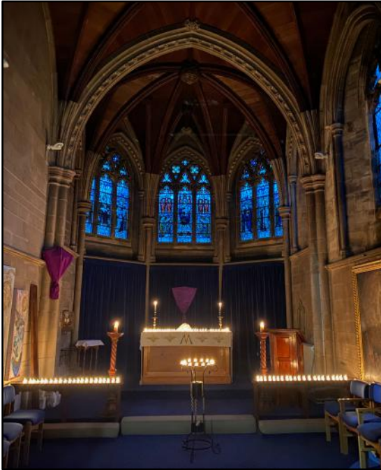
Mundy Thursday vigil in the Lady Chapel

The main Cathedral service on Sunday is the Sung Eucharist at 11.00am. This service of Holy Communion follows the seasonal variations of the Scottish Liturgy 1982, as revised in 2022 and using inclusive language.