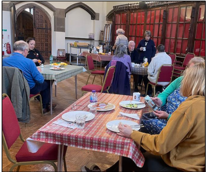
Our 'warm space' volunteers have provided hot drinks and lunches to the Perth people over the past two winters

The Cathedral has an active website and Facebook presence, which are regularly updated, to promote services and activities within the Cathedral. Our monthly Cathedral magazine is available both online and in print.