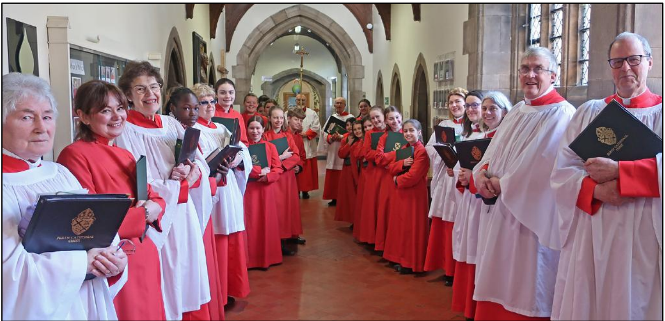
The Cathedral Choir, with the choristers of Ardvreck School, before the start of a morning service

The director of music works closely with the Provost and ministry team to prepare the liturgy, music and orders of service throughout the year. The director of music serves as both organist and choirmaster, assisted by an experienced conductor and organ scholar. The choir sings a wide range of traditional and contemporary church music.