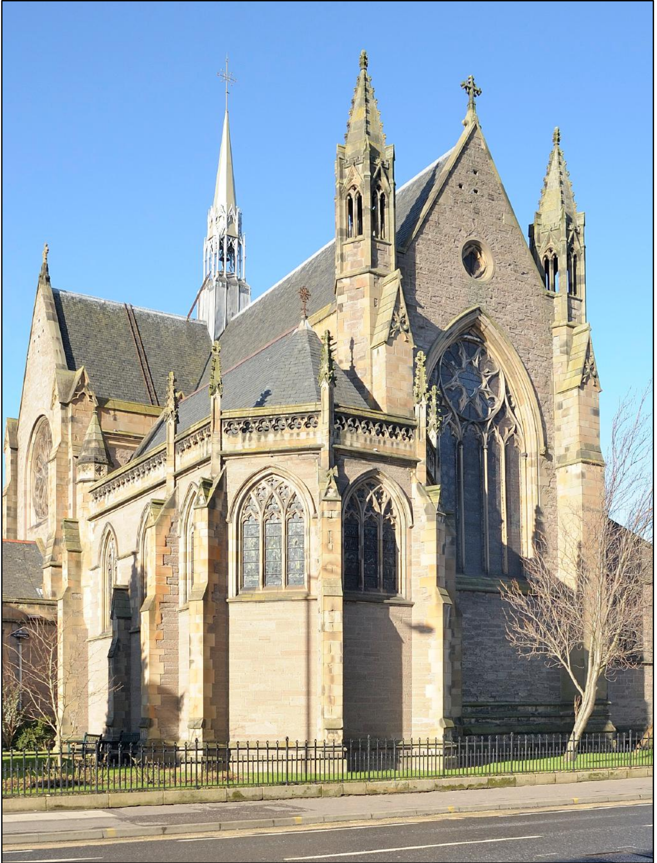
Exterior view of the Cathedral