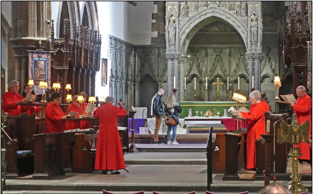
Doors Open Day 2023. The Choir sings while visitors admire some of our 'treasures'