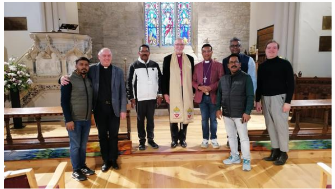
St Johns, Perth