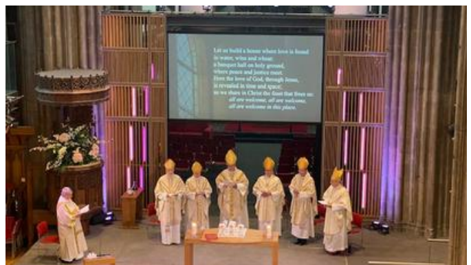
College of Bishops