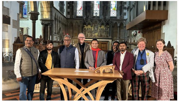
Saint Andrews, St Andrews