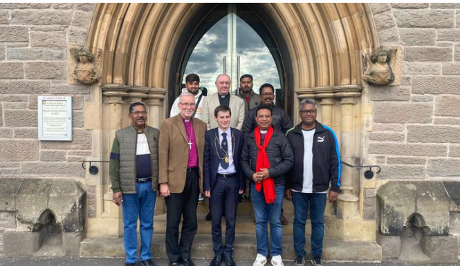
St Johns, Perth