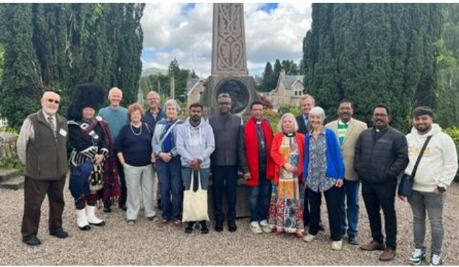
Alexander Duff Memorial