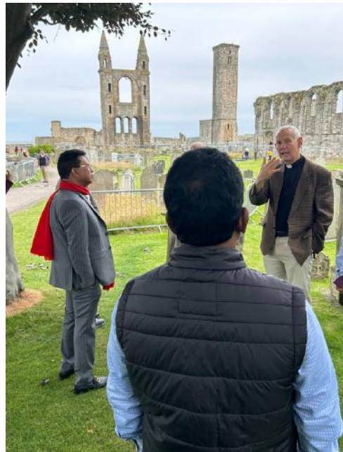
St Andrews Cathedral