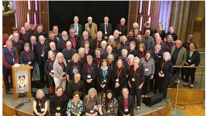
Thursdays In Black