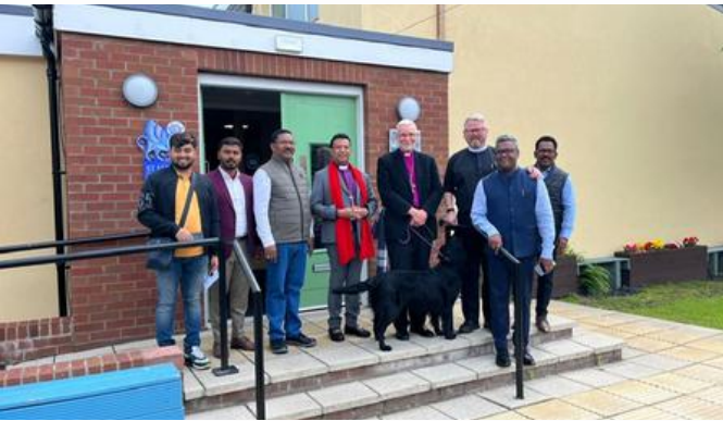
St Lukes, Glenrothes