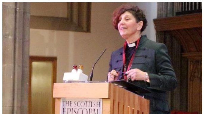
Rt Revd Sally Foster-Fulton