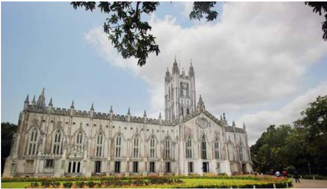
St Paul's Cathedral, Kolkata