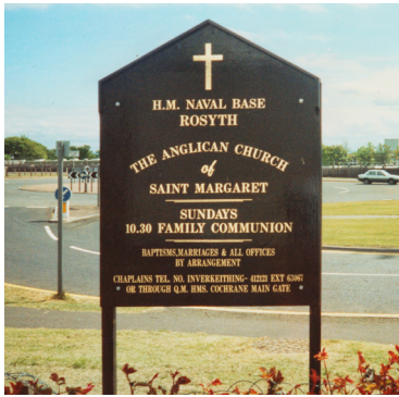
St Margaret's 30 years ago ...